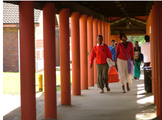
Eshowe Campus King Dinizulu Road, Eshowe Tel: 035 474 2304/06 Fax: 035 474 2817