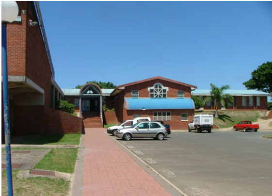
Esikhawini Campus Tel: 035 796 5568/76 Fax: 035 796 5530