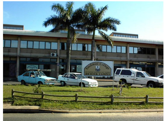
Richtek Campus Cnr Via Richardia & Naboomnek Tel: 035 902 9500 Fax: 035 789 7011