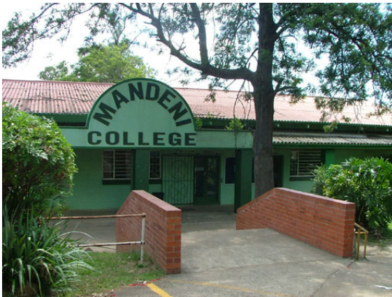
Mandeni Campus End of Anderson Road, Mandeni Tel: 032 456 3626 Fax: 032 456 5777