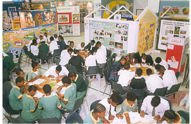
Zululand Career Centre